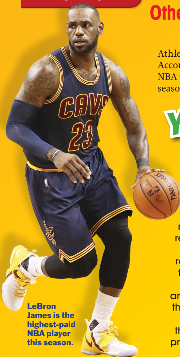
LeBron James is the highest-paid NBA player this season.

Doctors and nurses play a critical role in our society. But sporting events are entertainment. True, athletes put a lot of work into their craft. But society would still be able to function without athletes. There are many professions that keep our world running. We should pay more for professions that we as a society could not live without.